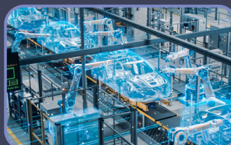
Industrial Control Systems