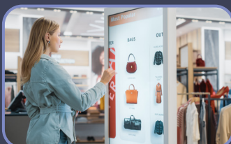
Digital Signage & Retail